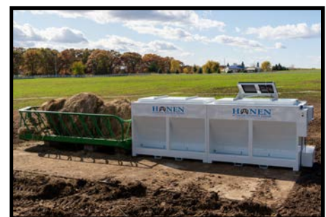
Dispense grain, cubes, or pellets in controlled rationing for optimal nutritional value.