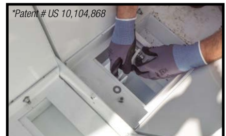
Hoppers fasten together with 6 bolts + link kit in 1-hour.

LSF-12 DIMENSIONS: Length: 9 feet; Depth: 4 feet; Height: 8 feet EMPTY WEIGHT: 1,500 lbs